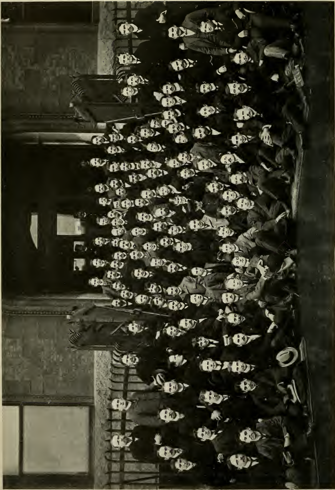
THE GRADUATING CLASS OF 1898, COLLEGE OF PHYSICIANS AND SURGEONS, COLUMBIA UNIVERSITY